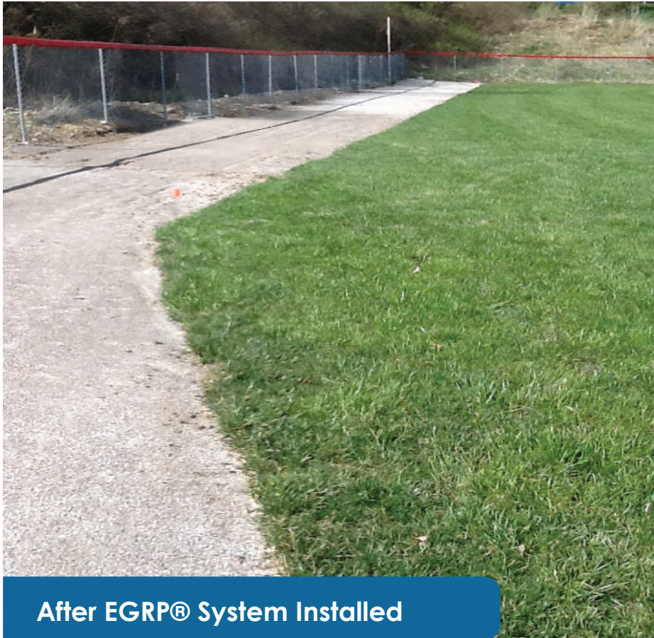
After EGRP® System Installed